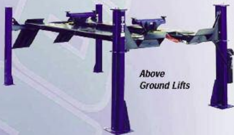
Above Ground Lifts