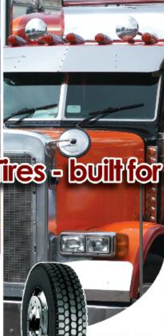
Truck & Bus Radial