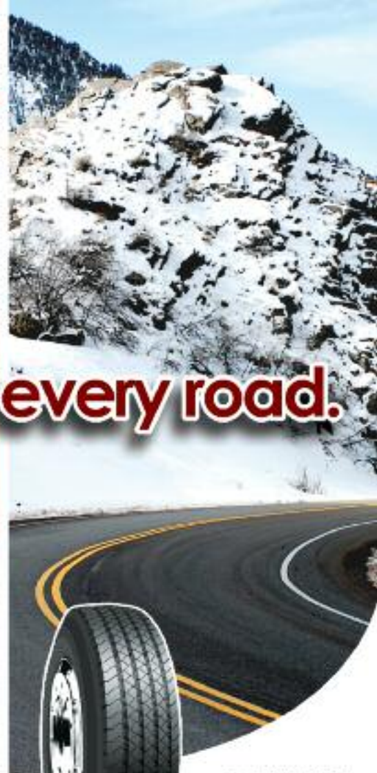
Truck & Bus Radial