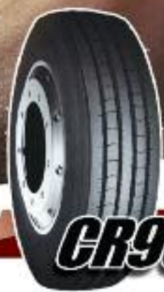
Truck & Bus Radial