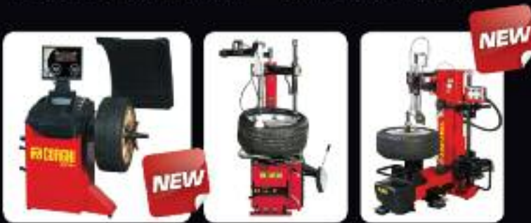
EM7280 3D A9324TI-DV-1000 ARTIGLIO 500

TO SCHEDULE OUR DEMO TRUCK, CONTACT OUR ONTARIO SALES MANAGER: TERRY LEFEBVRE • 416-902-5663