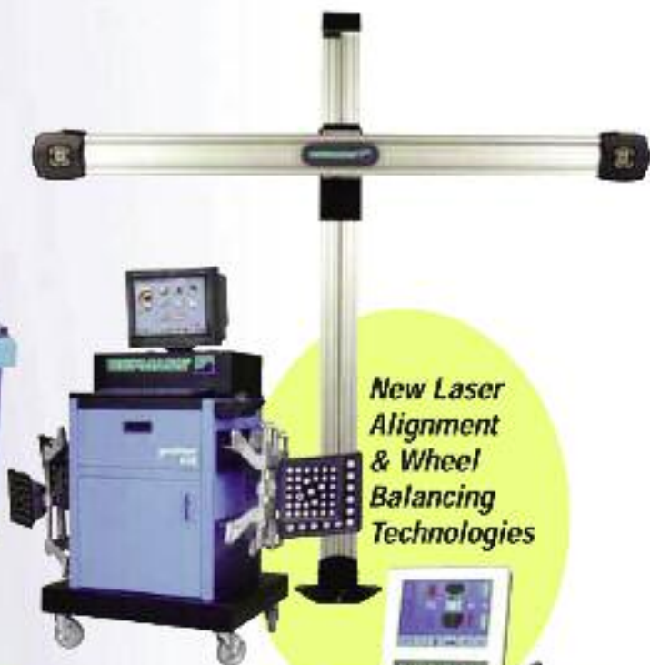
New Laser Alignment & Wheel Balancing Technologies