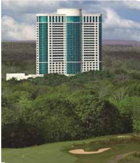
Foxwoods Premier Ballroom