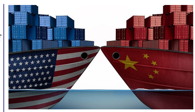
sides on 15 December in the absence of a phase one trade deal.

Chief among the culprits of the weak performance is the US-China trade war. Additional tariffs are scheduled to be implemented from both